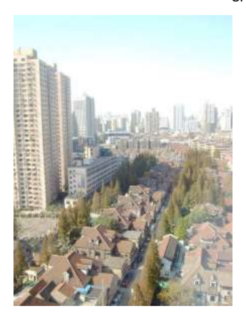
Tenements Old Shanghai from the Hotel