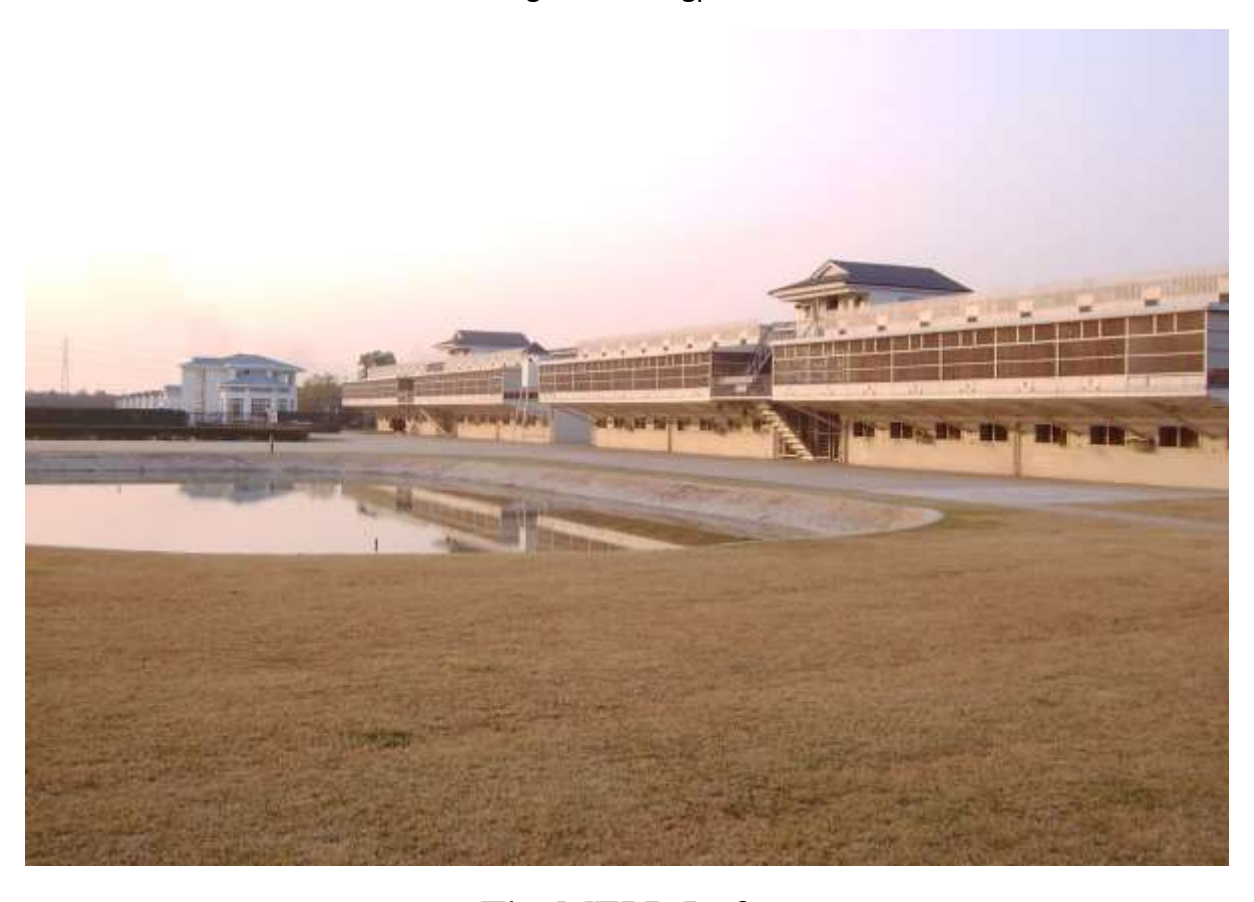
The MEPR Lofts