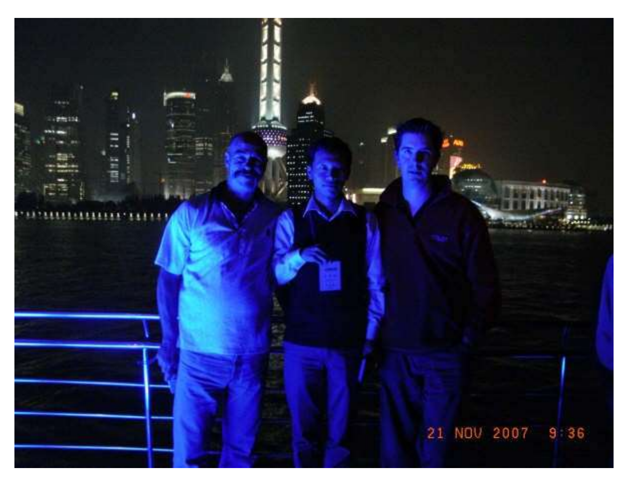
Cruising the "Huangpu River"