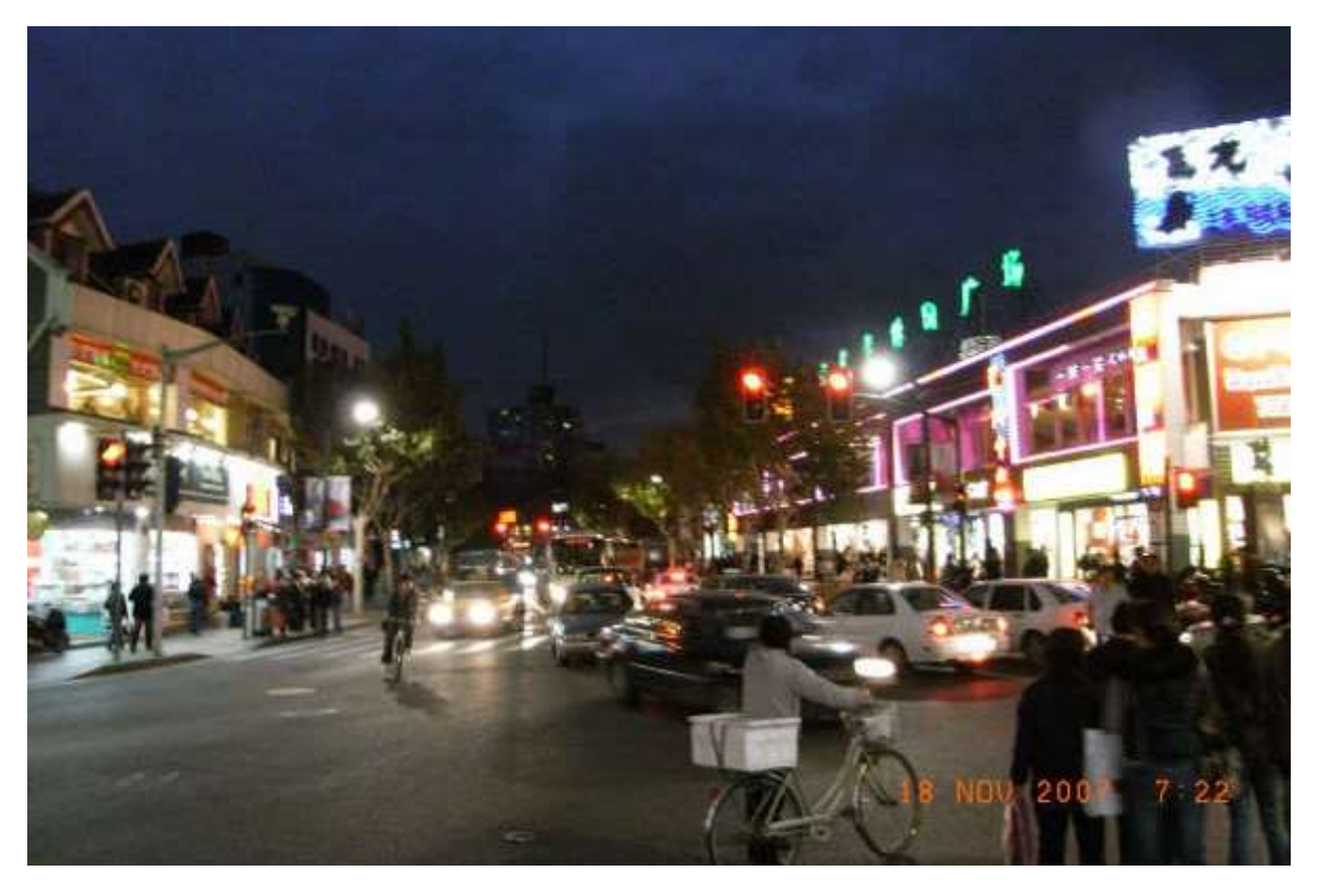
"Old Shanghai" at night